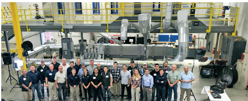
Osprey – Atlanta 2018 Airflow Training participants