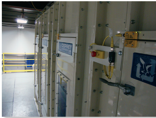
RFID Door Switches