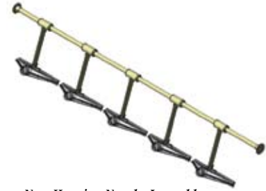
New Hanging Nozzle Assembly