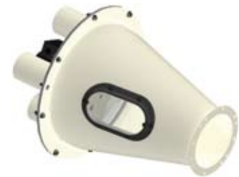
New Rotary Diverter Valve