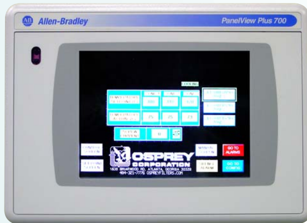
New PLC based controls with touch screen.

Osprey is currently in production on its latest version of the in-line pelletizer. The new system will serve as a demonstration unit. It will include all the latest design improvements in order to make in-line processing as easy as possible. Please contact Osprey if you are interested in setting up a free trial of your scrap film or nonwoven material. ▶▶