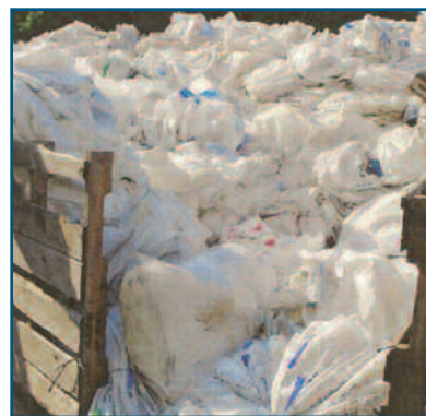
Turn this (left), into 4" x 4" bricks, shown below left.

Turn your scrap problems into money-saving solutions with the Osprey 330 Scrap Heat Compactor. Capable of densifying any flexible poly-based material into a brick or log, typically at bulk weights of 40 lb/ft 3 or more, you can cut your scrap volume tenfold.